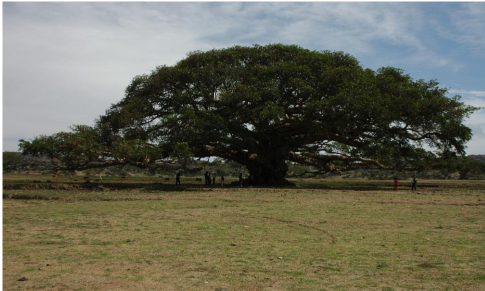
The plain of the Sycamores

Coming from the narrow valley that leads to Hebo coming from the small town of Segheneiti, after having crossed the plain of Sycamores and driven for 10 km in an un-maid road, suddenly appears at the end of the valley the village of Hebo.