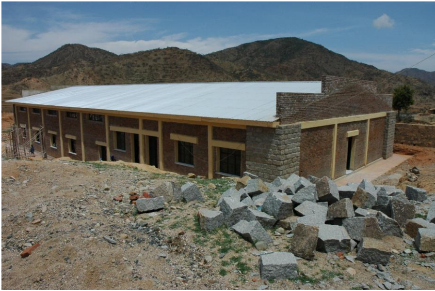
the area outside the building - backside