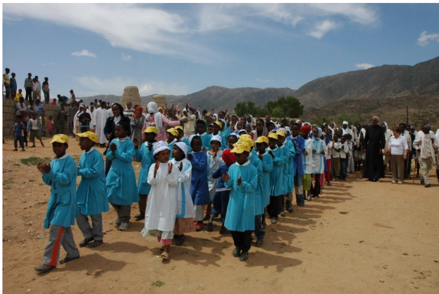
The community of Hebo

A crowd was waiting for us at the entrance of the village, almost all the community of Hebo chanting the glory of God. Priests, sisters, women, men, boys and girls. It was their day.