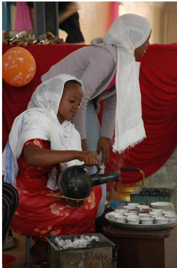
the coffee ceremony