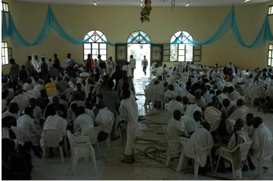
the meal for all the village