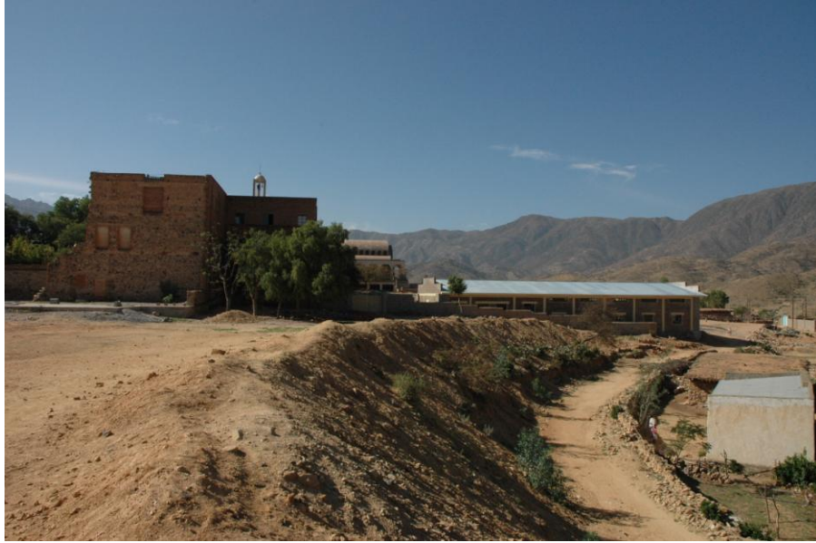
the Oratory, the House of the Fathers and the Sanctuary